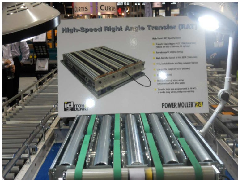
F-RAT – High Speed Right Angle Transfer