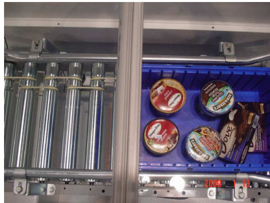
Power Moller with low temperature option demonstrated in freezer

APR is a dynamic intermediate storage system consisting of straight and turntable pallet handling conveyor units, allowing flexible pallet entry, retrieval as well as relocation /sequencing. Thanks to the self travel of each pallet in the storage system, random pallet entry can automatically be allocated for retrieval sequence. Watch video